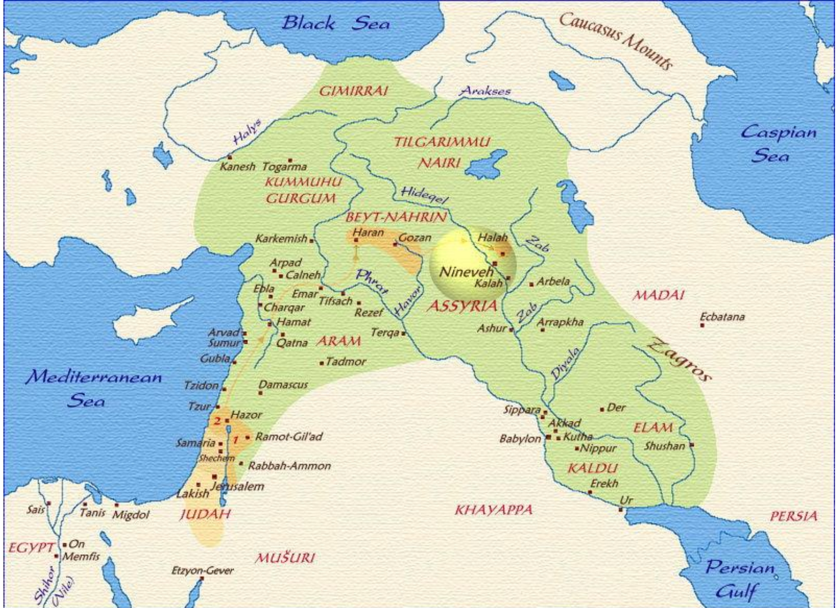
The ASSYRIAN EMPIRE under Tiglat-Pileser III and the first deportations of Israelites