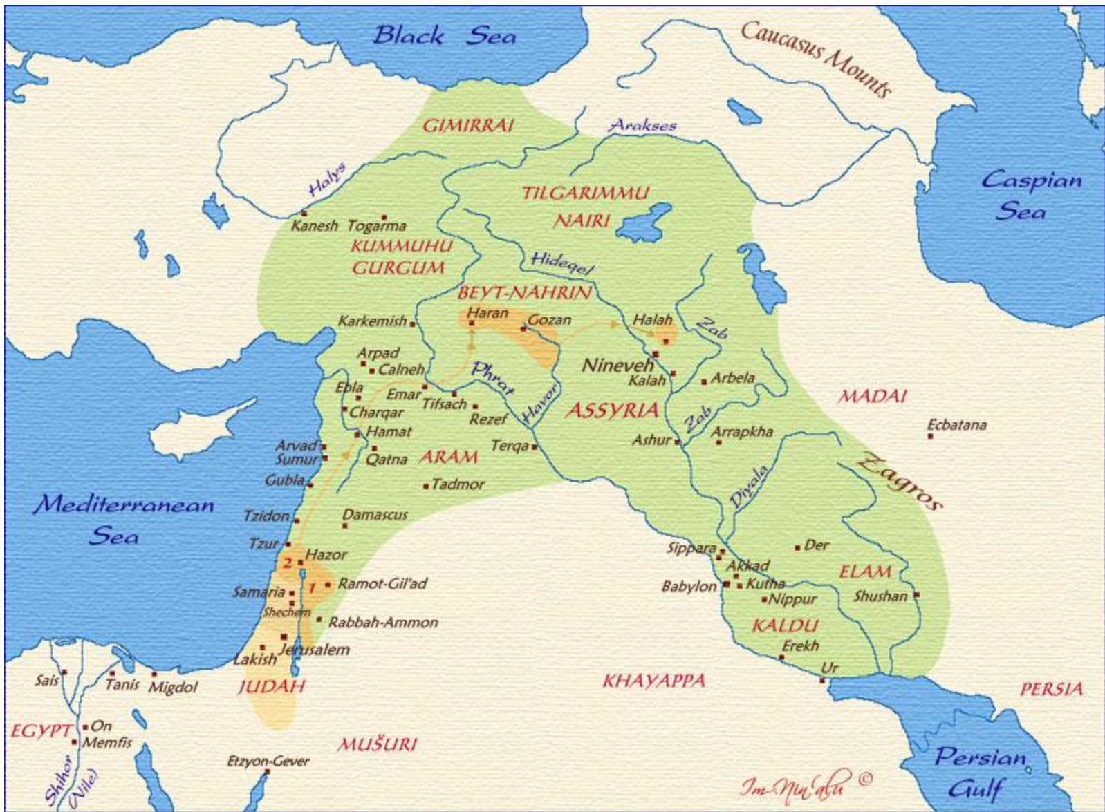
The ASSYRIAN EMPIRE under Tiglat-Pileser III and the first deportations of Israelites