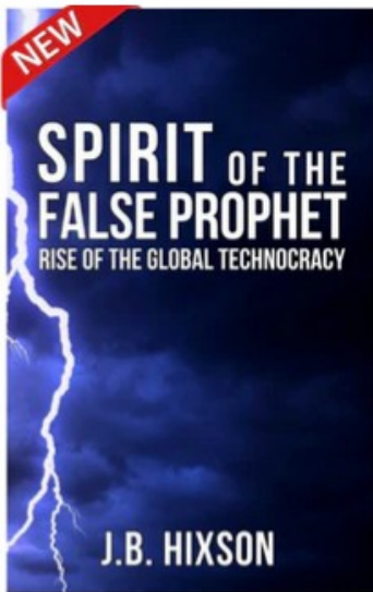
Spirit of the False Prophet