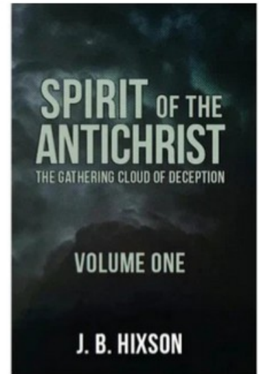
Spirit of the Antichrist Volume One

I found this presentation intriguing. There were people mentioned I had never heard of. There were efforts I was unaware of. For an unsaved person, this information might have been scary. But I know the creator of heaven and earth as my savior. I will fear no evil.